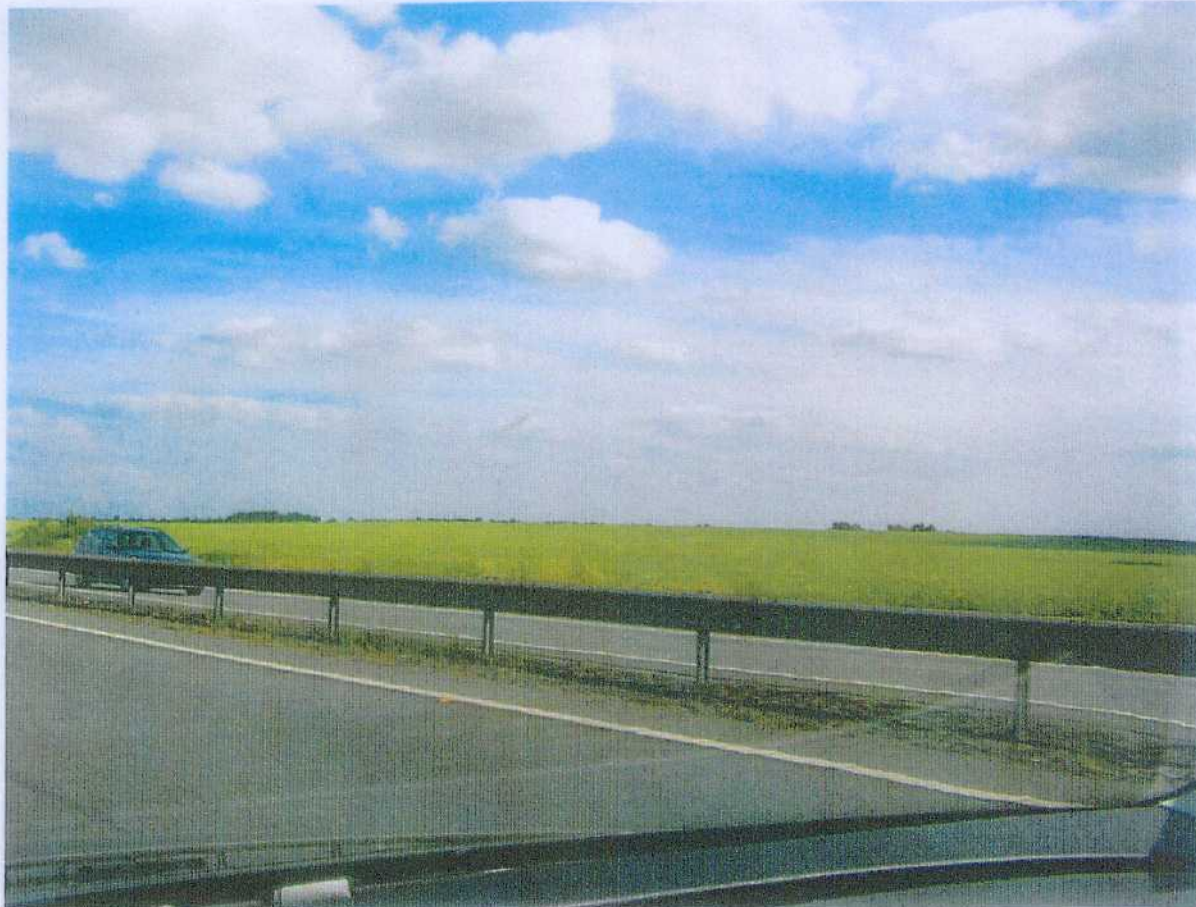
View of Boxworth and Connington site from A14 (southbound) Application S/1663/04/F (refused) (Note: no location reference on Fig 01).