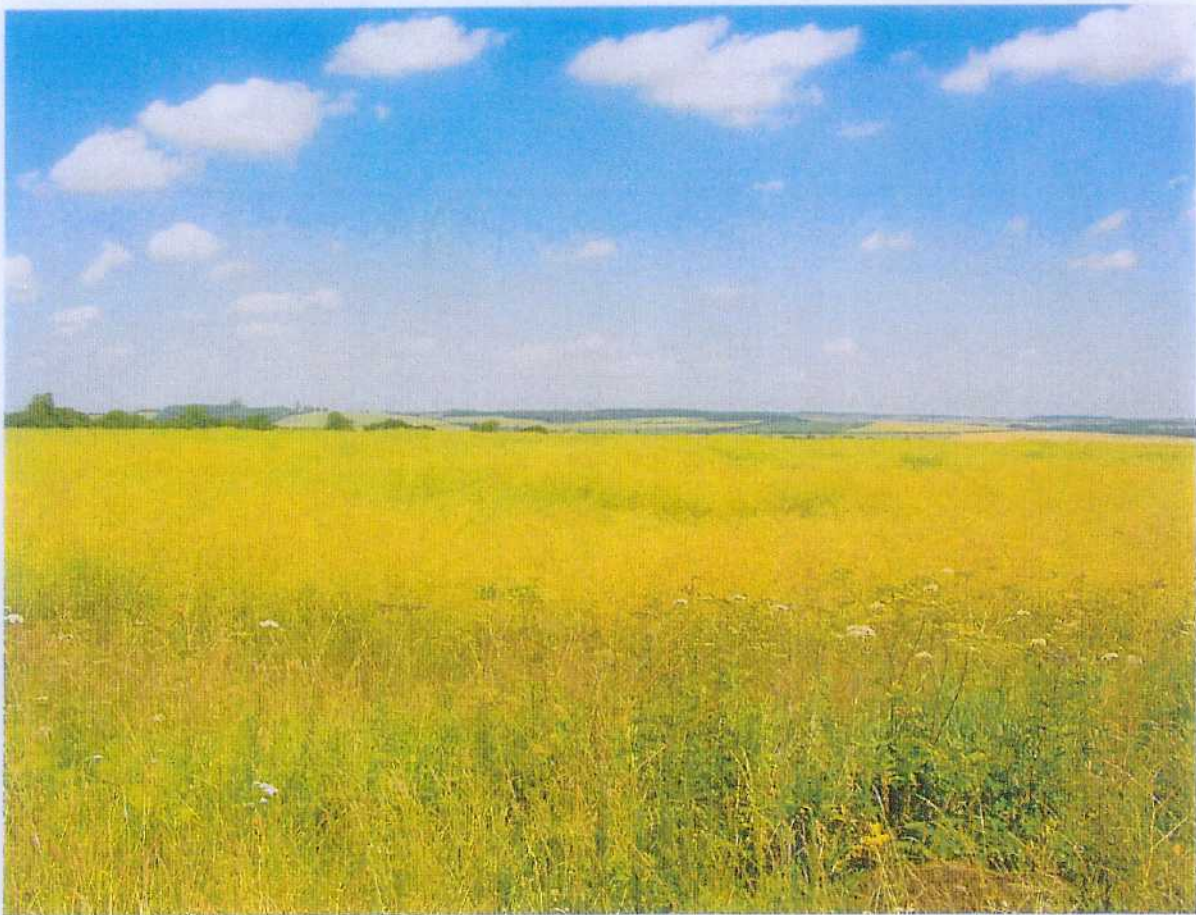
Viewpoint 4 View towards the site from the South, Hadstock (Note Rivey Hill tower, Linton on horizon). Turbines would be visible on skyline.