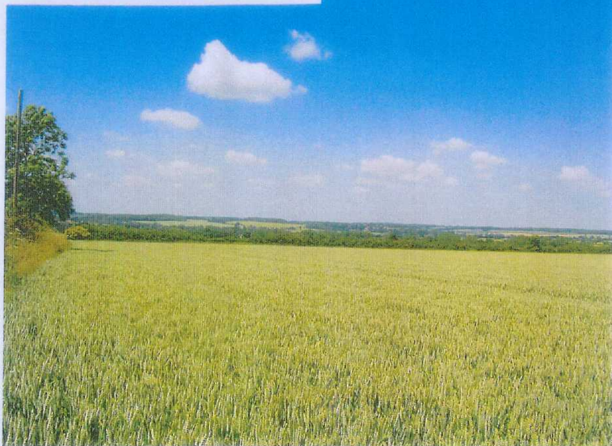
Viewpoint 5 View towards the site from the east, Broad Road, Little Thurlow Green. Turbines likely to be visible on skyline.