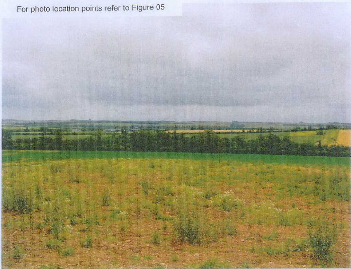
Viewpoint 3 View of site and ridge from Lodge Farm, south of Fulbourn and east of Wandlebury Country Park. Turbines would be dominant on the skyline.