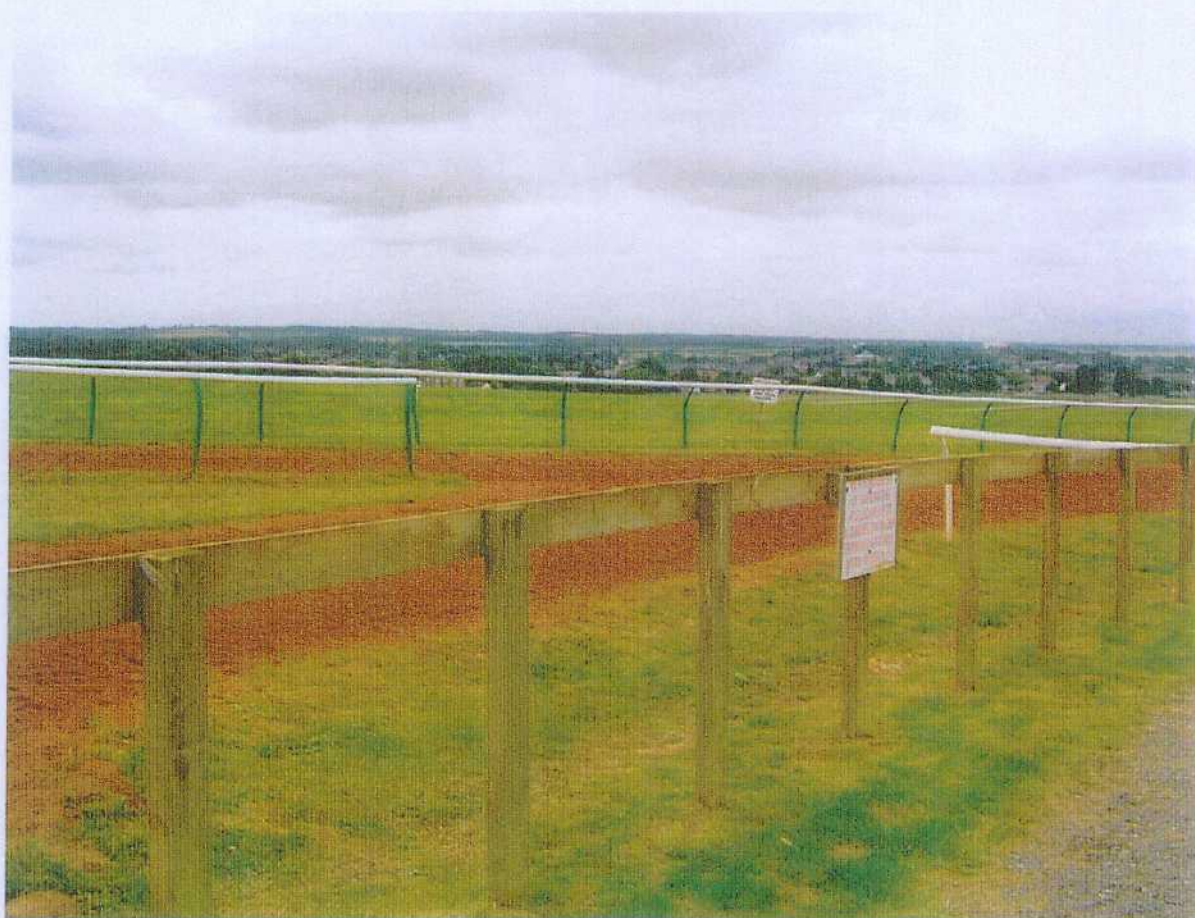
Viewpoint 6 View towards the site from north east from Warren Hill open access area, Newmarket. Turbines would be visible on skyline.